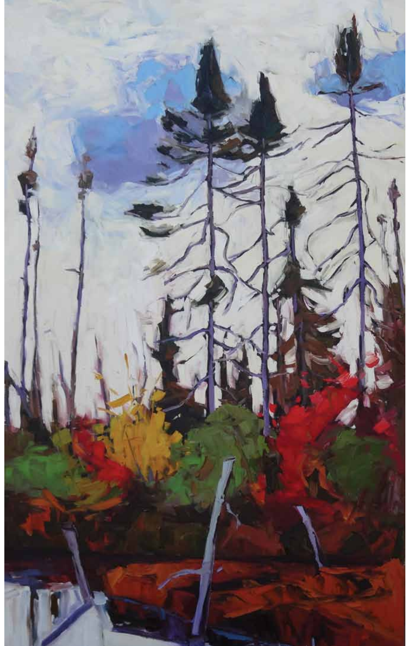
Wentworth Marsh Collection 10 - Laurentides, Québec, oil on canvas, 60" x 36"