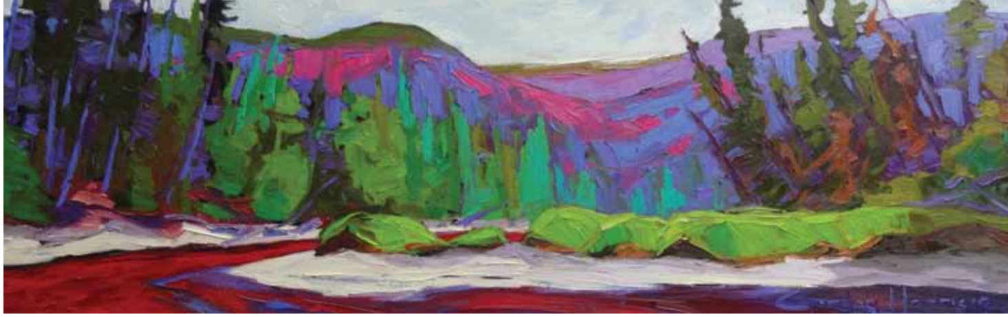
above, La Rivière de la Diable Collection 62 – Tremblant, Québec , oil on canvas, 20" x 60" below, Laden Spruce Collection 1 – Parc de la Gatineau, Québec , oil on canvas, 40" x 40"