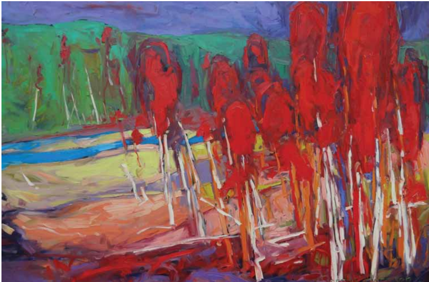
above, Rouge Enchanté Collection 11 – Parc de la Gatineau, Québec , oil on canvas, 48" x 72" right, Rêves d'Automne Collection 24 – Laurentides, Québec , oil on canvas, 40" x 30"