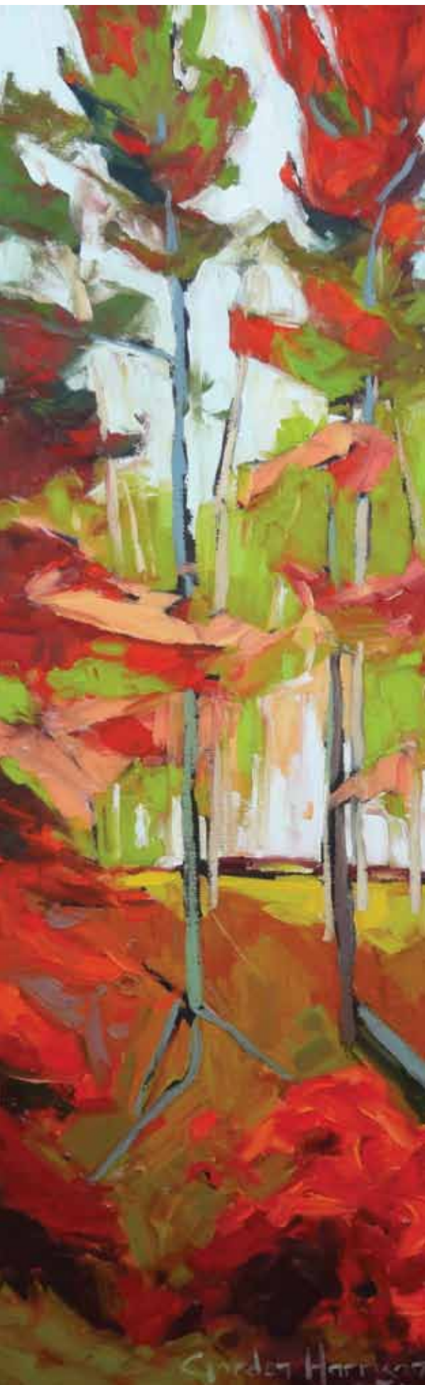
left, Rêves d'Automne Collection 33 – Laurentides, Québec , oil on canvas, 60" x 24" right, Rêves d'Automne Collection 17 – Laurentides, Québec , oil on canvas, 40" x 20"