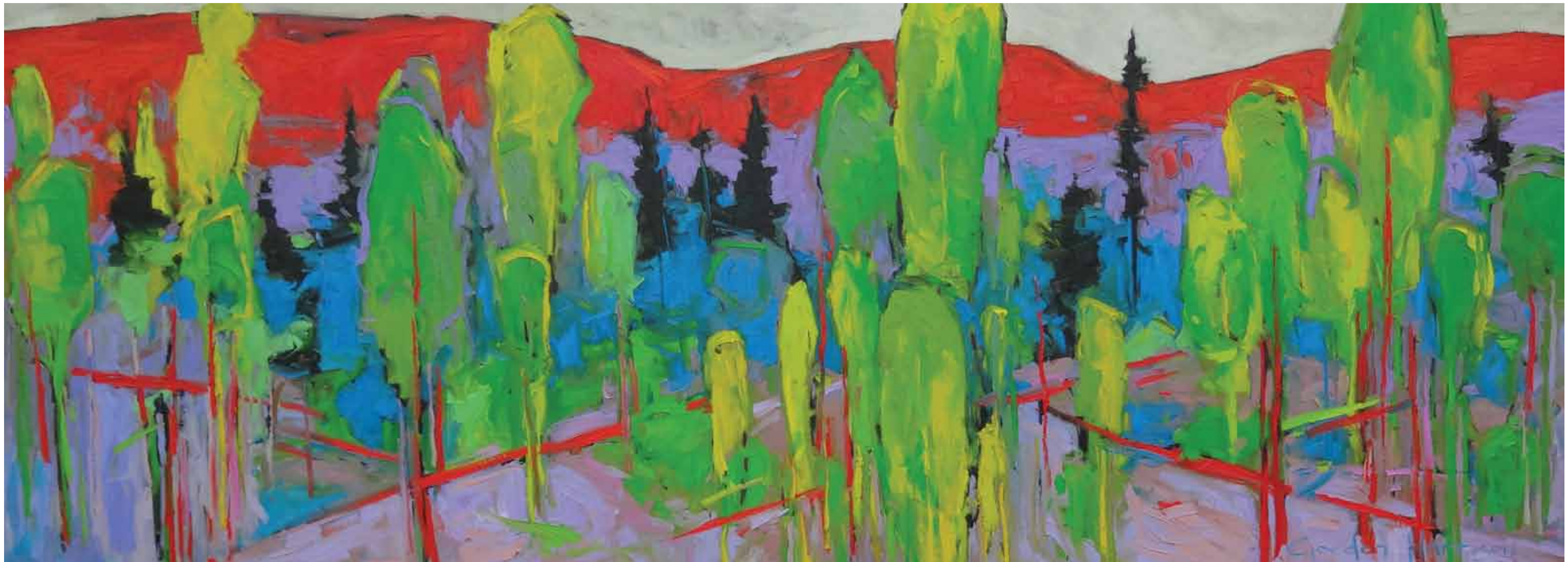
Peupliers de Piedmont Collection 14 – Piedmont, Québec, oil on canvas, 36" x 96"