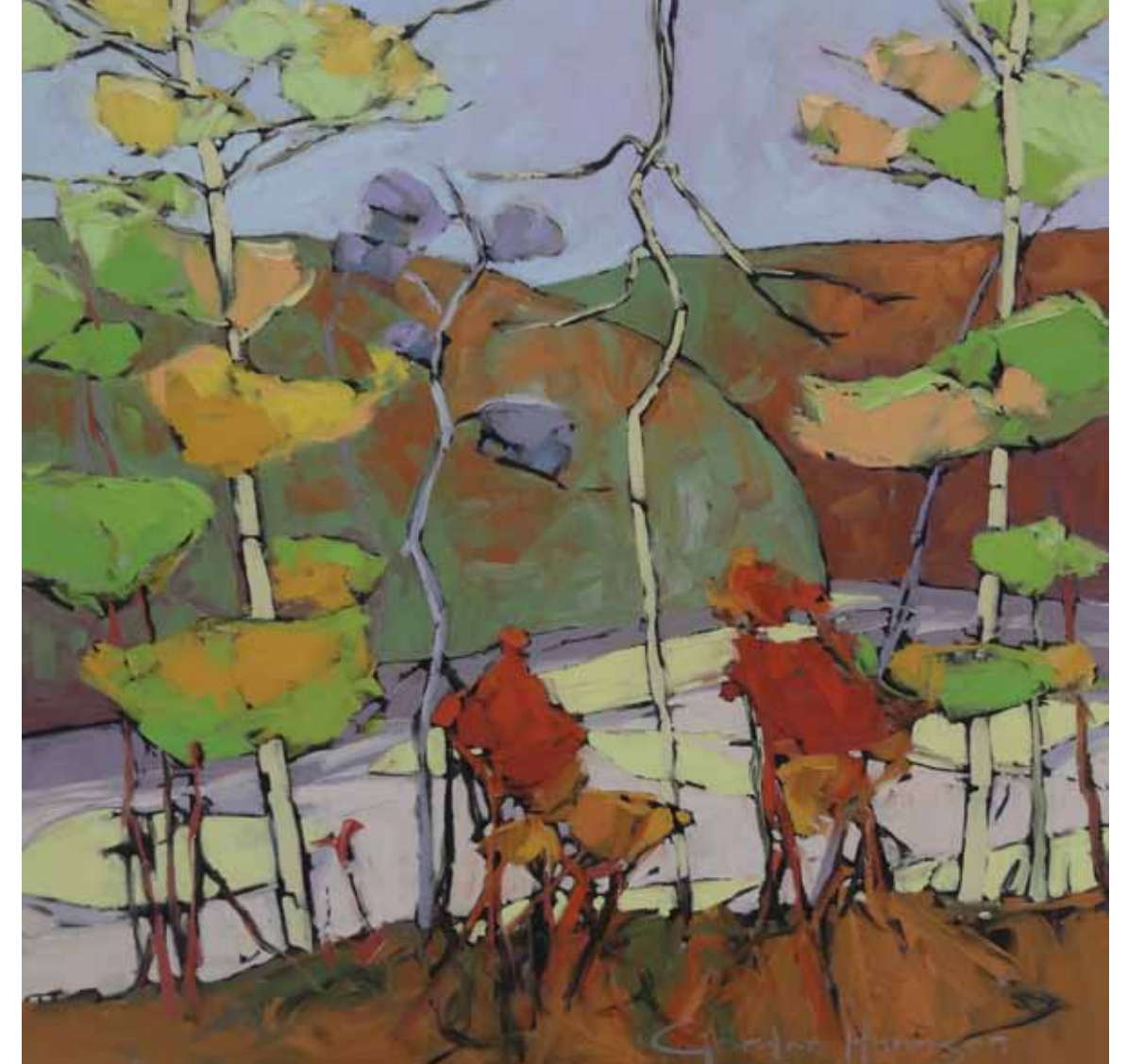
above, Rêves d'Automne Collection 16 – Laurentides, Québec , oil on canvas, 40" x 40"