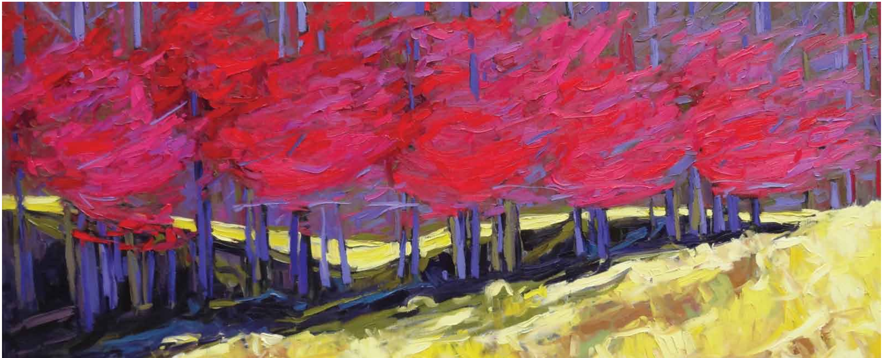
Rouge Enchanté Collection 9 – Parc de la Gatineau, Québec, oil on canvas, 36" x 84"