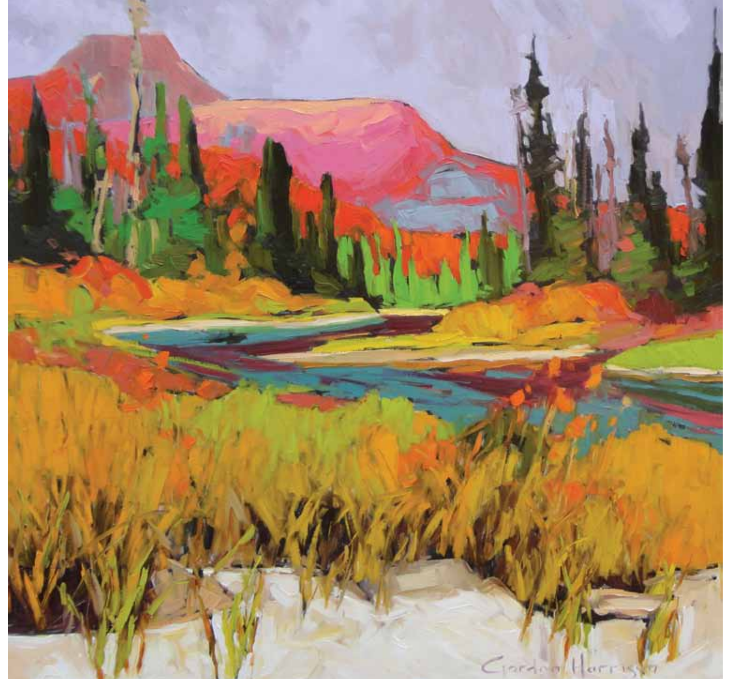
above, La Rivière de la Diable Collection 43 – Tremblant, Québec , oil on canvas, 40" x 40" below, Golden Willows Collection 1 – Prince Edward Island , oil on canvas, 36" x 84"