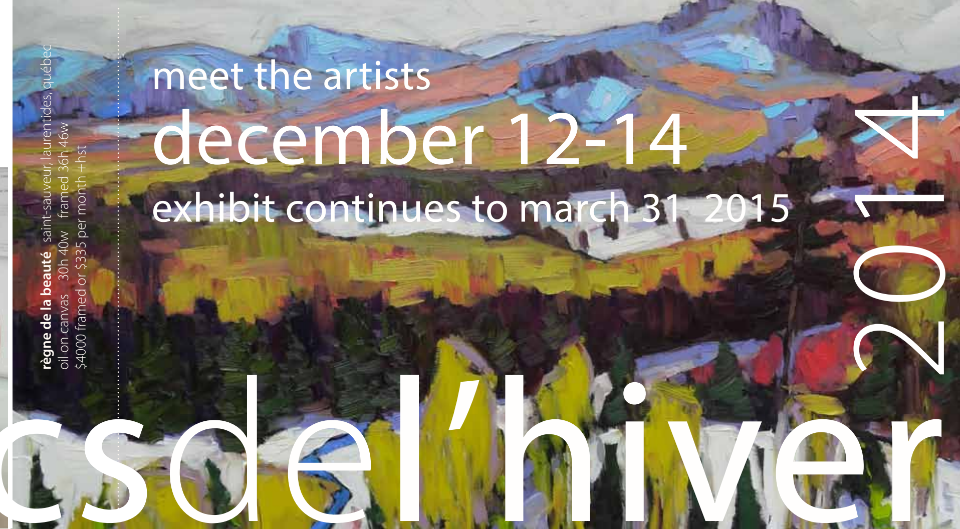
régne de la beauté saint-sauveur, laurentides, québec oil on canvas 30h 40w framed 36h 46w $4000 framed or $335 per month +hst

gift ideas weekend stay at artist's b&b in laurentians – one-day coaching painting session $450 – art retreat – 10-pack artist cards $30 – colours of canada book $100 – gift certificate – jewellery by dawn paterson