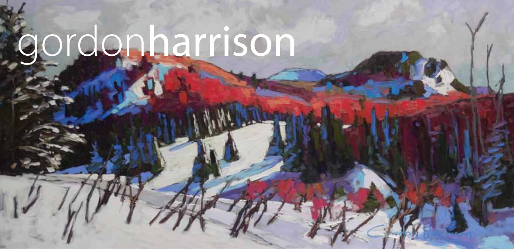
règne de la beauté collection 2 saint-sauveur-des-monts, laurentides, québec oil on canvas canvas 20h 60w framed 26h 66w $4200 framed or $350 per month for 12 months +hst