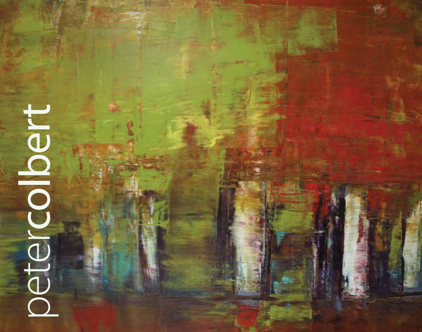
glen blend acrylic on canvas canvas 48h 60w framed 54h66w

$4800 framed or $400 per month for 12 months +hst