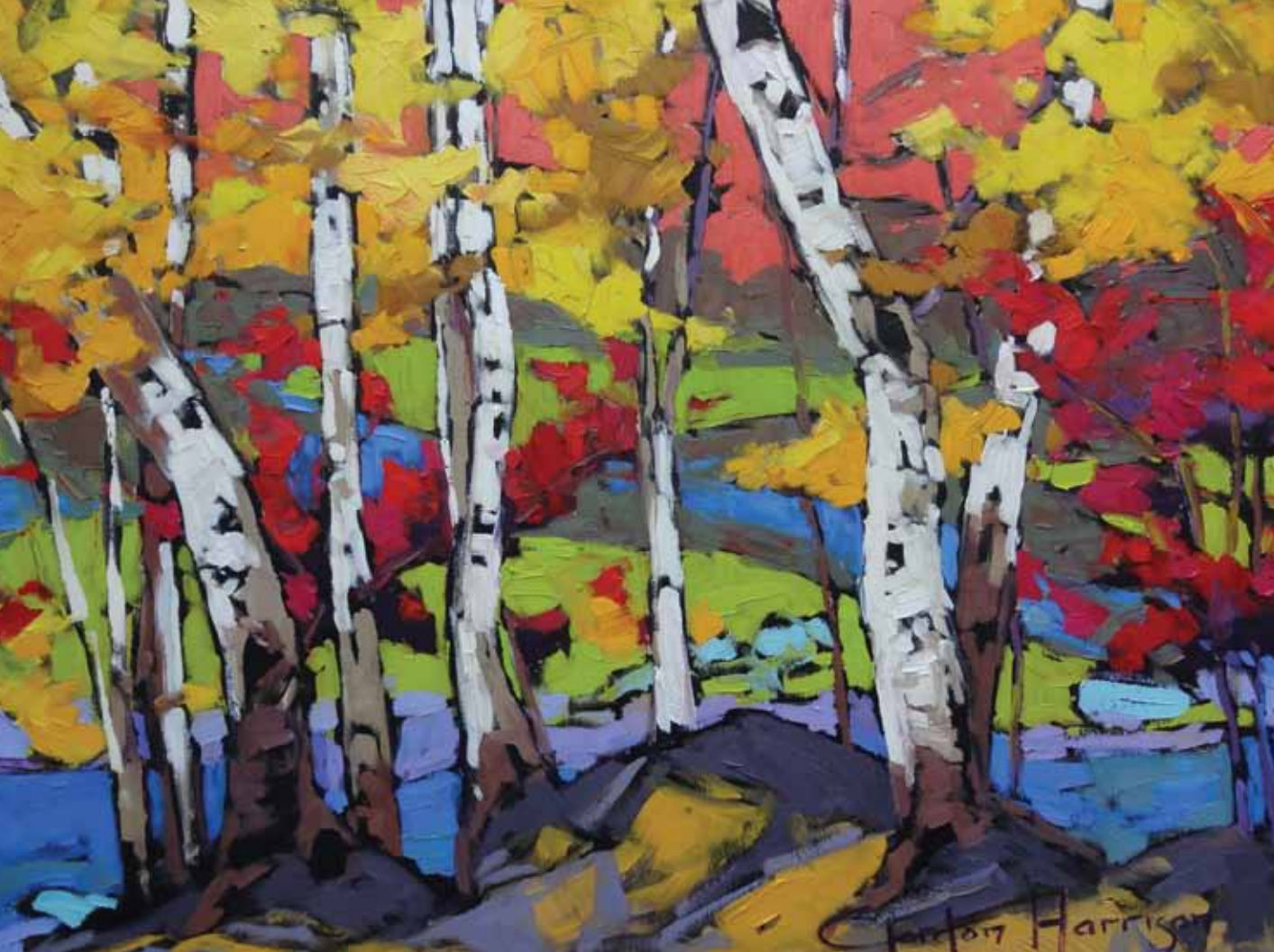
chamboisé collection 3 l'ange gardien, collines de l'outaouais, quebec

$4000 framed or $335 per month for 12 months +hst